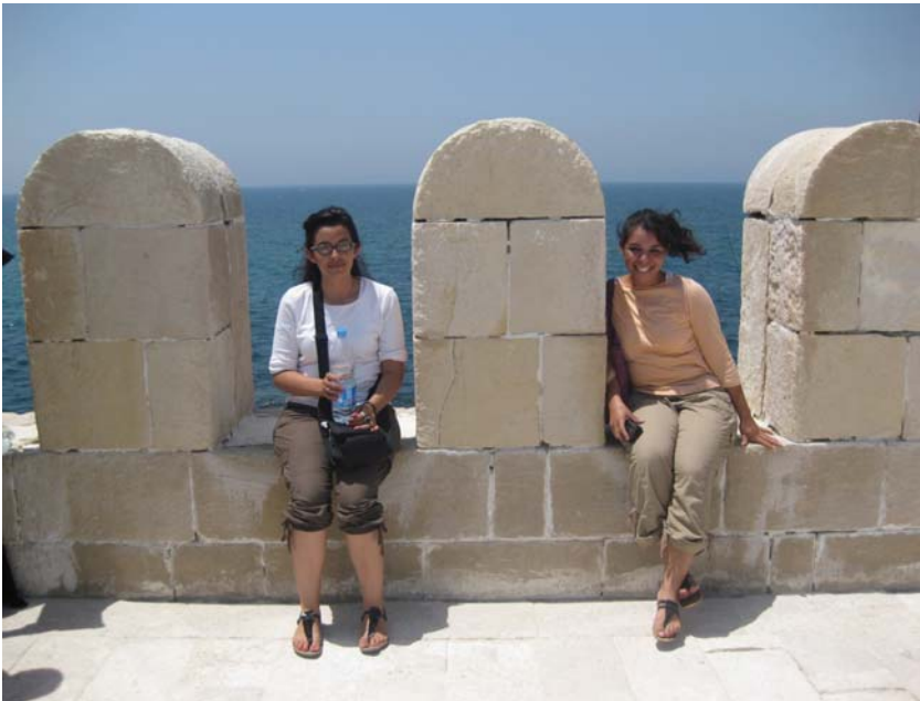
Alexandria the Citadel