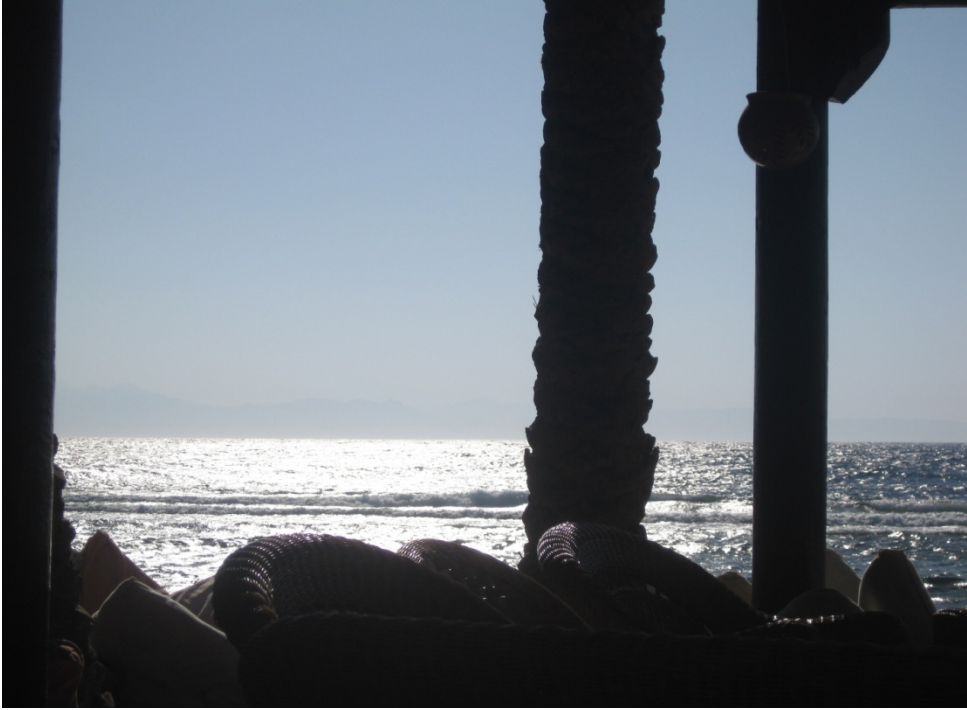
Dahab, Coast of Acqaba with a view of Saudi Arabia