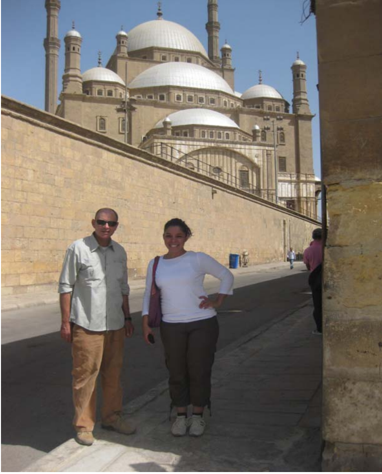
Cairo, the Citadel