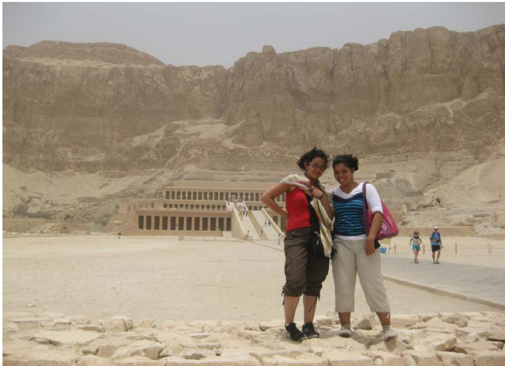
Temple of Hatshepsut