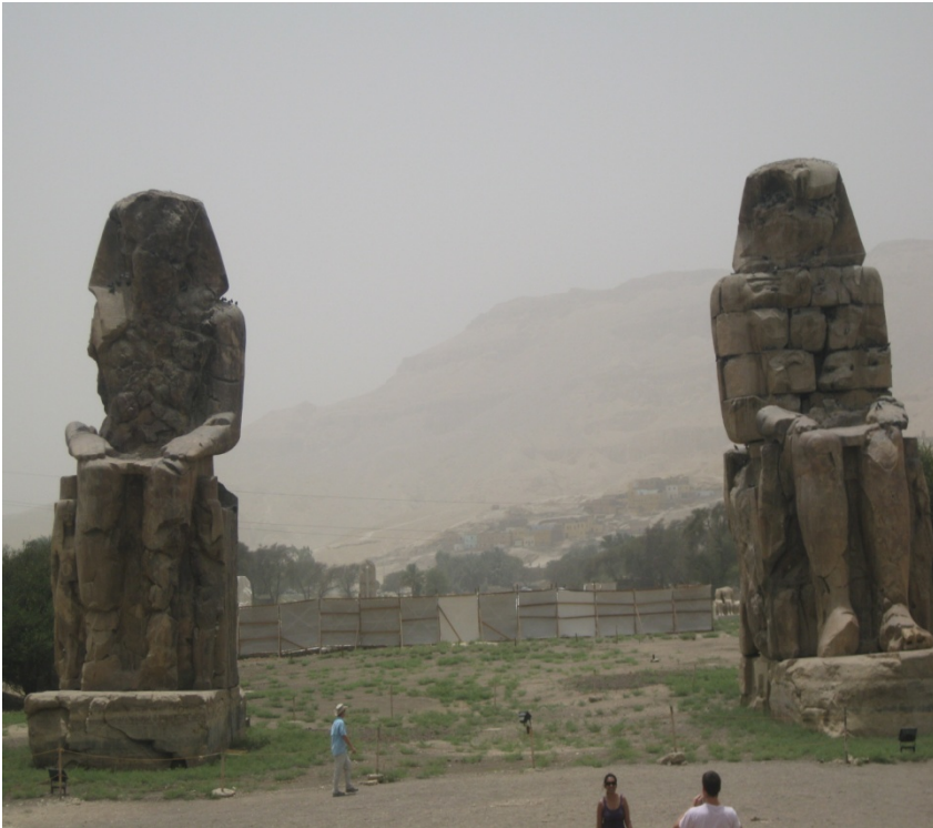
Colossi of Memnon