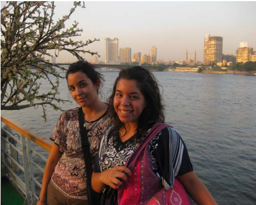
Nile dinner cruise